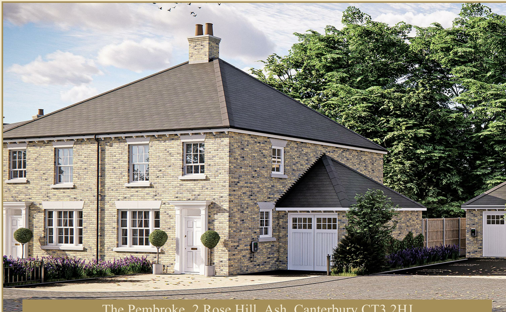
The Pembroke, 2 Rose Hill, Ash, Canterbury CT3 2HJ